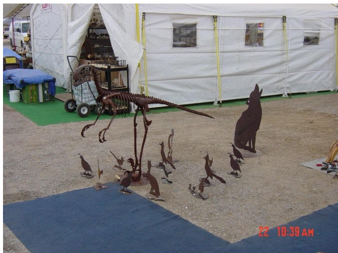
Some pretty cool sculptures we saw...

Some photos that were taken at Quartzsite!