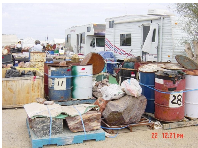
And more rocks...