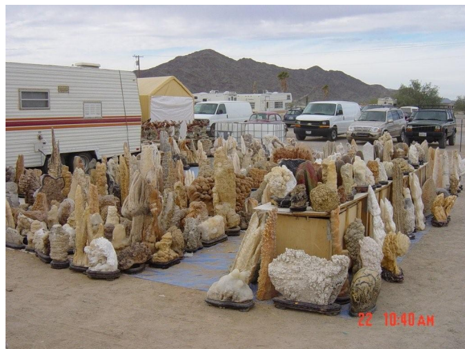
So many interesting things to see...