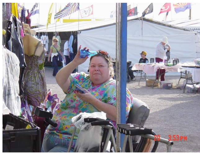
That's me, your editor....."Hey I found some pliers..."