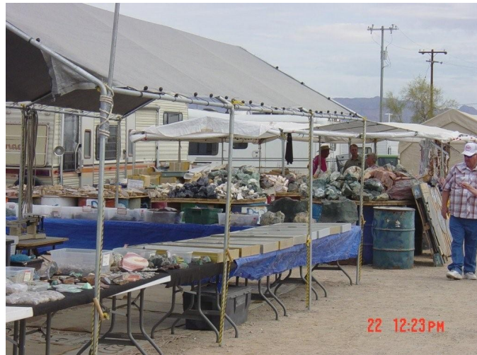
And still more rocks...